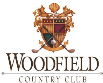
Photo Release Form The Country Club at Woodfield, Inc.

From time to time, Woodfield Country Club® or the media may, with the consent of the member, take photos of our members which include, but are not limited to: youth activities, special events, sporting events and special shoots for publicity reasons. These photos are used in our newsletter, brochures, local papers, the Woodfield Country Club website, and other publications to advertise/promote Woodfield Country Club. If you have any questions, please contact the Membership Department at (561) 995-5203.